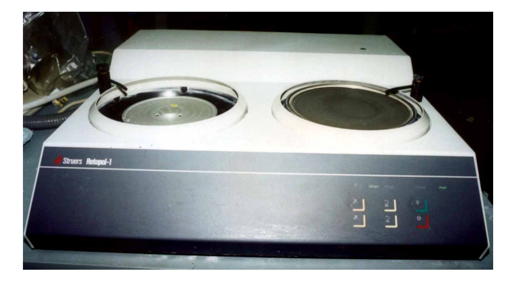
FIGURE 2: Grinding Plate, StruersRotopol - 1, Copenhagen, Denmark

FIGURE 1: Microslice 2 Precision Slicing Machine (Malvern Instruments, UK)